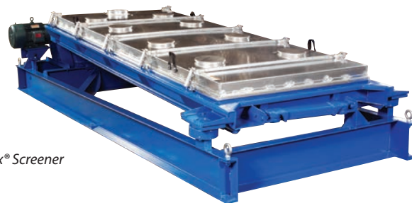
▲ Rotex® Screener