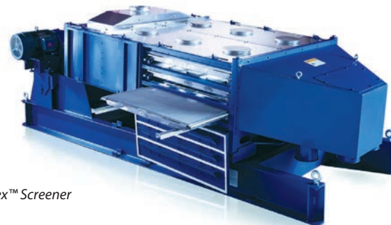
▲ Apex™ Screener