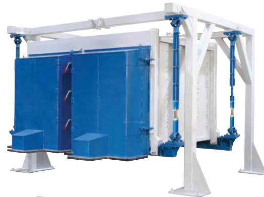
▲ Minerals Separator™