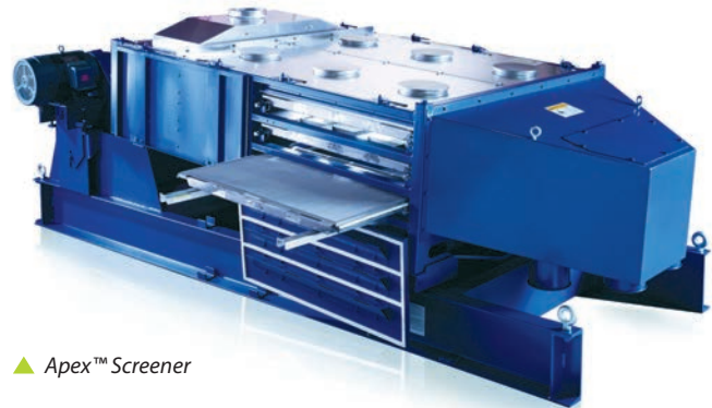
▲ Apex™ Screener