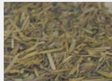
➤ Aspirated Particles