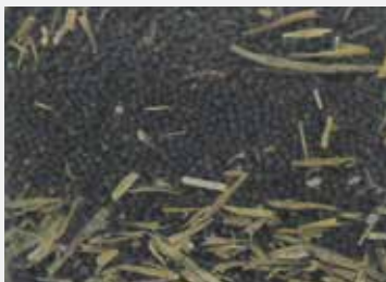
➤ Non-Aspirated Product

➤ These hoods allow air to be pulled over the falling product stream and are adjustable for various products and rates.