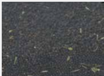
➤ Final Aspirated Product