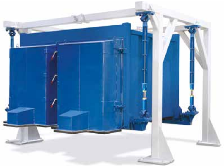
Minerals Separator/MEGATEX XD

The Rotex Minerals Separator and MEGATEX XD provide unmatched industrial screening for high-volume applications requiring extremely accurate separations. These multilevel separators feature unique stacked designs for smaller footprints and were engineered to withstand the harshest of conditions.